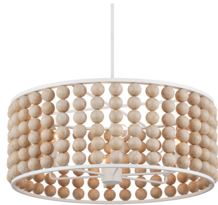
Shown in sugar white / sandstone

The wooden beads on this fixture were the inspiration for Ian Thornton as he designed around them to create the Holcroft Chandelier. The Sandstone-finished beads are fastened to a wrought iron frame dangling from a rod, both in a Sugar White finish to make this design surprisingly light. The large size of the beads is one of the surprising elements to this design that skews bohemian in style.