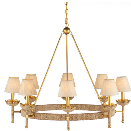
Shown in contemporary gold leaf / natural

PRODUCT DIMENSIONS . . . . . Adjustable Height: 34.5" to 102.5"