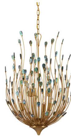
Shown in contemporary gold leaf / turquoise

PRODUCT DIMENSIONS . . . . . Adjustable Height: 37" to 105"