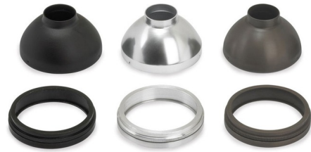
Shown in aluminum

Backlight Shield MR16 accessory available in solid Aluminum, Black or Antique Bronze. Includes louver lens holder and holds up to two lenses or louvers, sold separately. One 12 volt MR16 halogen lamp of up to 75 watts is required, but not included.