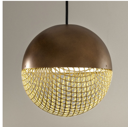
Shown in coated bronze / gold mesh