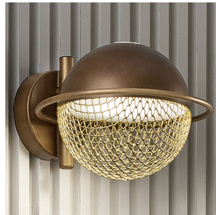
Shown in coated bronze / gold mesh

COLOR RENDERING . . . . . 90 CRI LAMP COLOR . . . . . 3000K LUMENS/WATT . . . . . 136.00 LUMINOUS FLUX . . . . . 1496 lumens