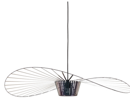
Shown in black / beetle iridescent black

The Vertigo Pendant is simultaneously ethereal and graphic, adapting to both large and small spaces where it creates it's own intimate space. With its ultra light fiberglass structure, stretched with velvety polyurethane ribbons, this pendant lamp fascinates as it comes to life swaying in the soft air currents that surround it.