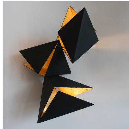
Shown in matte black