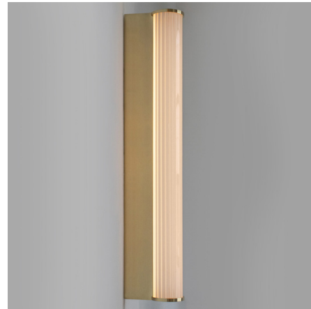
Shown in satin brass / frosted

The Ember S1 Wall Sconce shows off an elegant scalloped glass tube diffuser supported by two delicate rings at the ends. Casting a warm, inviting glow as LED light passes through the clear or frosted glass, it brings both illumination and style into your space. Note: This fixture does not mount to a standard US junction box.