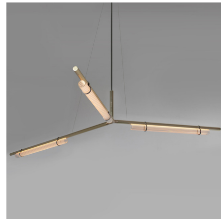
Shown in satin brass / clear

With its unique three-armed design, the Ember S6 Pendant brings modern sophistication into your space. Its arms emit warm LED light, with scalloped glass tubes attached to act as diffusers. The glass, available clear or frosted, adds texture to the design and creates captivating plays of light as the LEDs highlight its ridges.