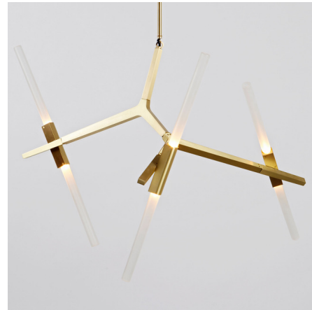
Shown in brushed brass / straight cut glass

The Agnes Chandelier offers a unique shape composed of linear metal segments and glass tube diffusers to form a molecule-like structure. The chandelier's dramatic silhouette and geometric lines give it a futuristic aesthetic that is sure to attract attention. Available with angled-cut or straight-cut glass diffusers.