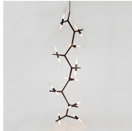
Shown in bronze / straight cut glass

The Agnes Cascade Chandelier offers a unique shape composed of linear metal segments and glass tube diffusers to form a branching, molecule-like structure. The chandelier's dramatic silhouette and geometric lines give it a futuristic aesthetic that is sure to attract attention. The glass diffusers can be angled to create a customized look to suit the space. Available with angled-cut or straight-cut glass diffusers.