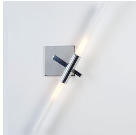
Shown in polished nickel / straight cut glass

The Agnes Wall Sconce offers a sleek shape composed of linear metal segments and glass tube diffusers to form a linear structure. The sconce's dramatic silhouette and geometric lines give it a futuristic aesthetic that is sure to attract attention. The diffuser can be tilted 95 degrees to either side for a dynamic look. Available with angled-cut or straight-cut glass diffusers.