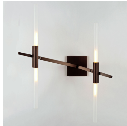
Shown in bronze / straight cut glass

The Agnes Double Wall Sconce offers a sleek shape composed of linear metal segments and glass tube diffusers to form a branching structure. The sconce's dramatic silhouette and geometric lines give it a futuristic aesthetic that is sure to attract attention. The diffusers can be tilted 95 degrees to either side for a dynamic look. Available with angled-cut or straight-cut glass diffusers.