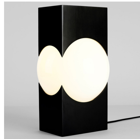
Shown in blackened brass / white

The Atlas 02 Table Lamp is composed of pure geometric forms with a spherical diffuser set within a rectangular brass base. The glass globe houses an integrated LED light source to provide soft, ambient illumination with a graceful, modern aesthetic. Dimmer switch located on cord.