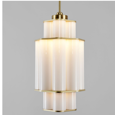
Shown in brushed brass / white

LAMP LIFE . . . . . 50000 hours COLOR RENDERING . . . . . 90 CRI LAMP COLOR . . . . . 2700K LUMENS/WATT . . . . . 32.50 LUMINOUS FLUX . . . . . 1300 lumens