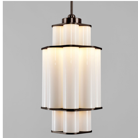
Shown in bronze / white

LAMP LIFE . . . . . 50000 hours COLOR RENDERING . . . . . 90 CRI LAMP COLOR . . . . . 2700K LUMENS/WATT . . . . . 32.50 LUMINOUS FLUX . . . . . 1300 lumens