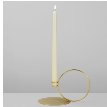
Shown in brushed brass

The Bugia Candle Holder features an arrangement of simple geometric forms for an elegant, modern look. Bugia's circular base and handle are playfully balanced for an asymmetrical but visually harmonious expression. Candle not included.