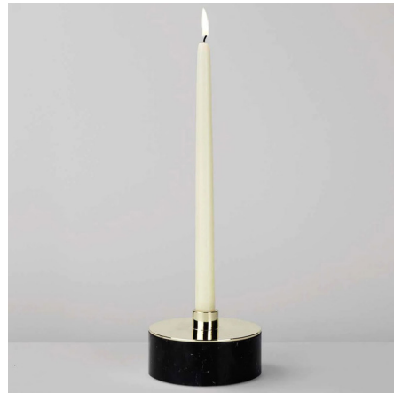
Shown in black marble / polished brass

The Cache Candle Holder provides a clean, streamlined accent piece that will elevate the decor of any table setting. The hollow marble base is topped with a polished brass cap which will hold a single taper candle. Candle not included.