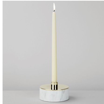
Shown in white marble / polished brass

The Cache Candle Holder provides a clean, streamlined accent piece that will elevate the decor of any table setting. The hollow marble base is topped with a polished brass cap which will hold a single taper candle. Candle not included.