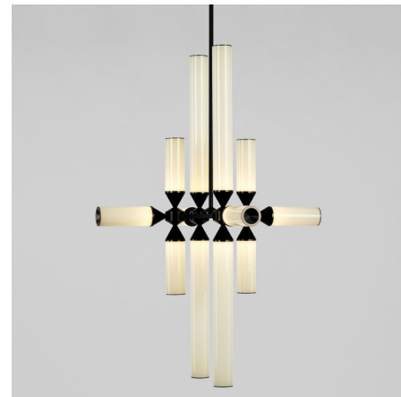
Shown in black / cream

While the Castle 12-03 Pendant vaguely resembles the parapets of a castle wall, it was actually inspired by the castle-shaped chess piece of the rook, which can only be moved vertically or horizontally. The pendant's structure reflects the chess piece's orthogonal movements with tubular glass diffusers emerging vertically and horizontally from the metal frame. The glass softly diffuses light from the integrated LED light source to provide ambient illumination.