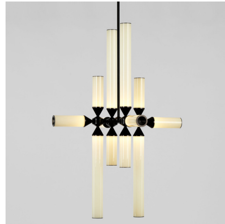
Shown in black / cream

While the Castle 12-04 Pendant vaguely resembles the parapets of a castle wall, it was actually inspired by the castle-shaped chess piece of the rook, which can only be moved vertically or horizontally. The pendant's structure reflects the chess piece's orthogonal movements with tubular glass diffusers emerging vertically and horizontally from the metal frame. The glass softly diffuses light from the integrated LED light source to provide ambient illumination.