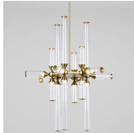
Shown in brushed brass / clear

While the Castle 18-03 Pendant vaguely resembles the parapets of a castle wall, it was actually inspired by the castle-shaped chess piece of the rook, which can only be moved vertically or horizontally. The pendant's structure reflects the chess piece's orthogonal movements with tubular glass diffusers emerging vertically and horizontally from the metal frame. The glass softly diffuses light from the integrated LED light source to provide ambient illumination.