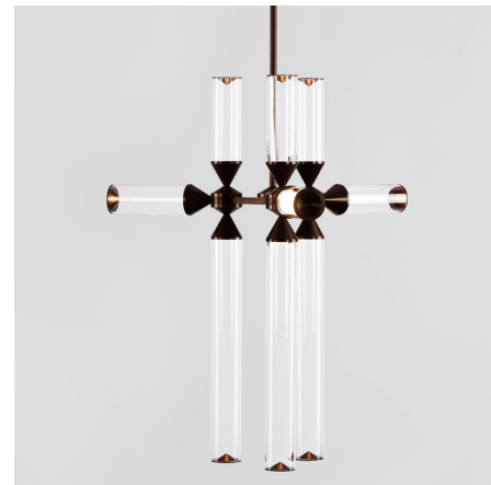
Shown in bronze / clear

While the Castle Pendant vaguely resembles the parapets of a castle wall, it was actually inspired by the castle-shaped chess piece of the rook, which can only be moved vertically or horizontally. The pendant's structure reflects the chess piece's orthogonal movements with tubular glass diffusers emerging vertically and horizontally from the metal frame. The glass softly diffuses light from the integrated LED light source to provide ambient illumination.