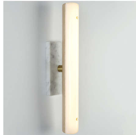
Shown in white marble / light ash

The Counterweight Wall Sconce features a glass diffuser backed by steam-bent wood and anchored with a marble backplate. The solidity of the marble provides a visual counterbalance to the sconce's light and sleek design and a luxe material accent.