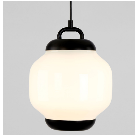
Shown in blackened steel / white

The Esper Pendant offers a modern reinterpretation of Japanese chochin lanterns, which are frequently displayed outside of restaurants and bars to welcome visitors. Esper's streamlined form gives it a distinctly modern character while giving a subtle nod to traditional craftsmanship.