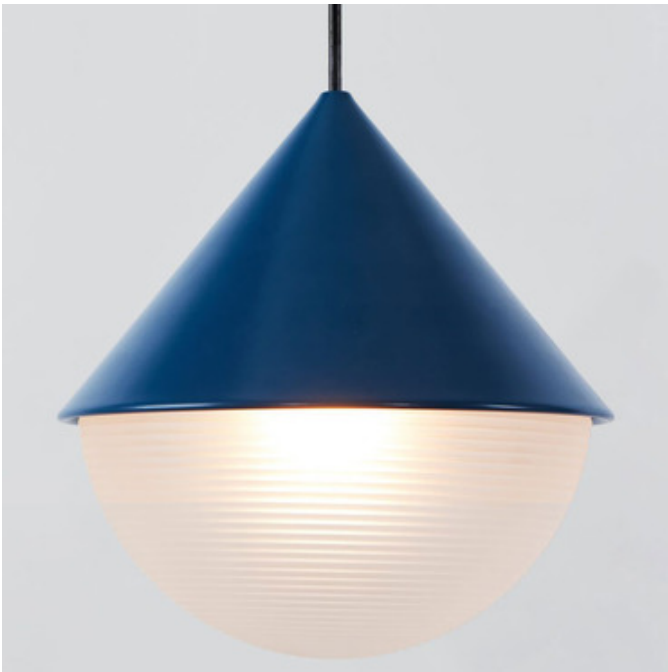
Shown in: Blue / Frosted

The Half & Half Pendant takes its name from its steel and glass construction with a ridged glass diffuser capped by a conical steel shade. The pairing of contrasting materials, shapes, and textures adds visual interest to the pendant's sleek, geometric design.