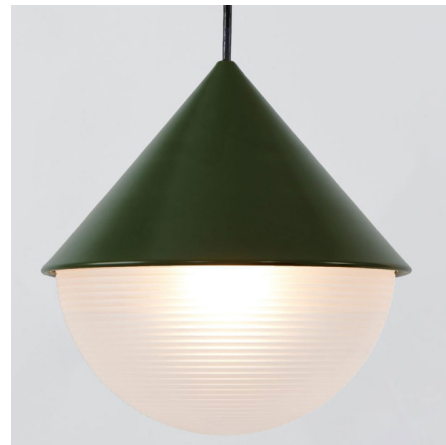
Shown in green / frosted

The Half & Half Pendant takes its name from its steel and glass construction with a ridged glass diffuser capped by a conical steel shade. The pairing of contrasting materials, shapes, and textures adds visual interest to the pendant's sleek, geometric design.