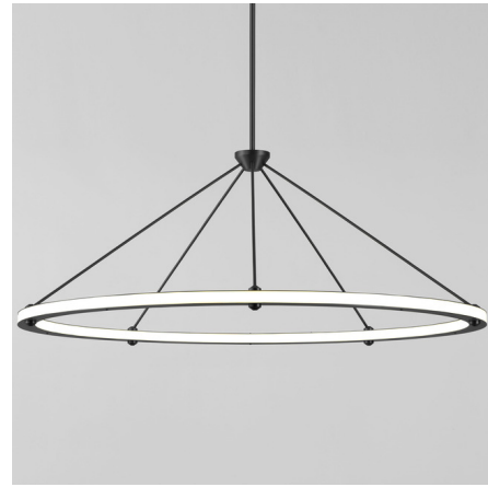
Shown in blackened steel

The Halo Circle Pendant makes use of energy-efficient LED technology to create a dramatic display of light. The pendant features an illuminated acrylic ring supported by a sleek steel frame. The frame's open, cage-like structure creates a light, airy expression that will not obstruct the view of the surrounding room.