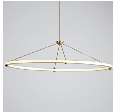
Shown in brushed brass

The Halo Oval Pendant makes use of energy-efficient LED technology to create a dramatic display of light. The pendant features an illuminated acrylic ring supported by a sleek steel frame. The frame's open, cage-like structure creates a light, airy expression that will not obstruct the view of the surrounding room.