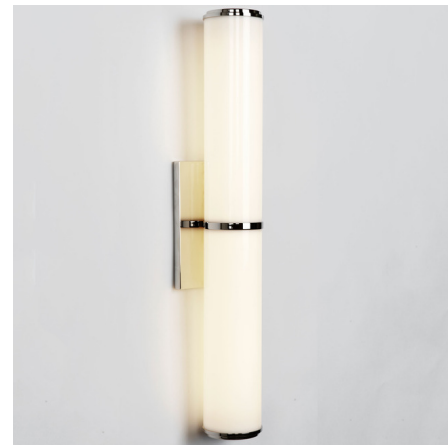
Shown in polished nickel / white

The Mini Endless Wall Sconce was designed to be an architectural element as much as a lighting fixture. Its tubular form recalls the shape of a sailing ship's mast or industrial piping. An integrated LED light source within the acrylic diffuser provides warm ambient light along the length of the fixture.