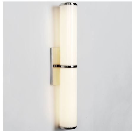
Shown in polished nickel / white

The Mini Endless Wall Sconce was designed to be an architectural element as much as a lighting fixture. Its tubular form recalls the shape of a sailing ship's mast or industrial piping. An integrated LED light source within the acrylic diffuser provides warm ambient light along the length of the fixture.