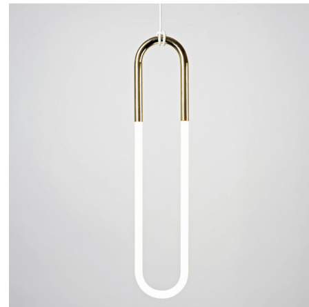
Shown in satin brass / white

While creating the Rudi Pendant, designer Lukas Peet took inspiration from jewelry and named the pendant after his father, a jeweler. Rudi's simple oval frame is composed of a bent metal tube and a hand formed glass diffuser housing an LED light source. The pendant is suspended from its cord, which is looped over the frame in a simple knot to provide a charming accent to the minimal design.