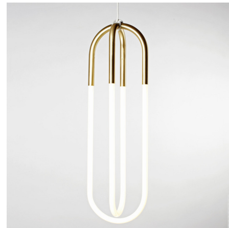
Shown in satin brass / white

While creating the Rudi Double Pendant, designer Lukas Peet took inspiration from jewelry and named the pendant after his father, a jeweler. Rudi's form is composed of a pair of intersecting ovals made from bent metal tubes and hand formed glass diffusers housing LED light sources. The pendant is suspended from its cord, which is looped over the frame in a simple knot to provide a charming accent to the minimal design.