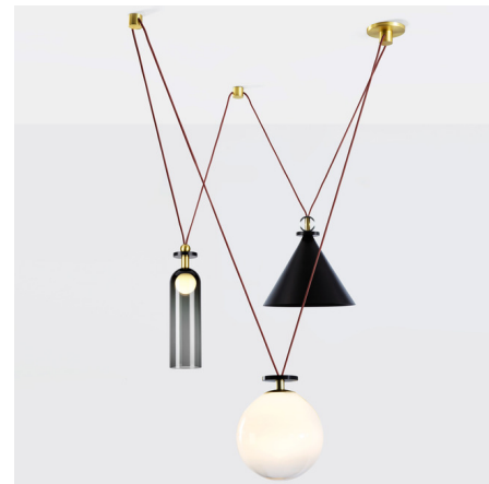
Shown in brushed brass / blackened steel

The Shape Up Three Light Chandelier offers a playful expression with its eclectic grouping of different shades. A metal cone shade, glass cylinder, and glass orb are suspended from a round canopy and two ceiling hooks and connected with fabric cable to form a constellation of light. Shape Up's versatile configuration allows the pendants to be arranged to best suit the surrounding room and make a strong statement with the fixture's dynamic asymmetry.