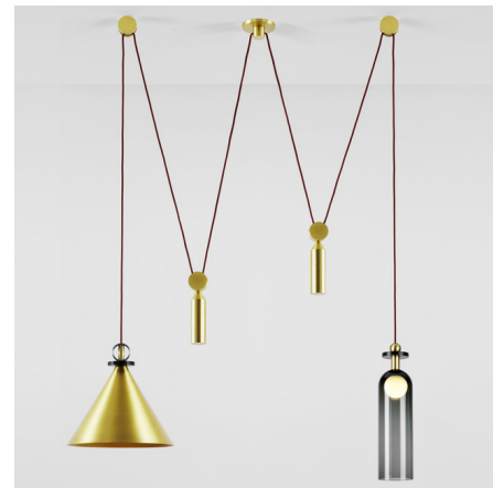
Shown in brushed brass / brushed brass

The Shape Up Double Pendant offers a playful twist on pendant lighting with mismatched shades and a versatile counterweight and pulley suspension system. The conical metal and cylindrical glass shades are suspended from ceiling pulleys that allow the hanging height of each pendant to be adjusted independently. In addition to their functional purpose, the dangling counterweights add a decorative accent that highlights the fixture's dynamic asymmetry.