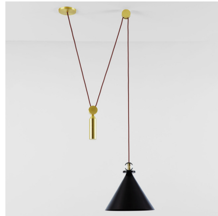
Shown in brushed brass / blackened steel

The Shape Up Cone Pendant offers a playful twist on a classic pendant shape with a versatile counterweight and pulley design. In addition to allowing the height of the pendant to be adjusted, the counterweight adds a distinctive visual element that adds dynamic asymmetry to the design.