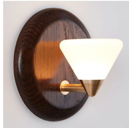
Shown in oxidized oak / white

While it may appear simple at first glance, the Apollo Wall Sconce features subtle detailing that adds understated style to its minimal silhouette. The conical glass shade houses an integrated LED light source to provide softly diffused illumination. A brushed brass arm supports the shade and provides a touch of shine. The round backplate is crafted from oak to add a rich natural texture for visual interest.