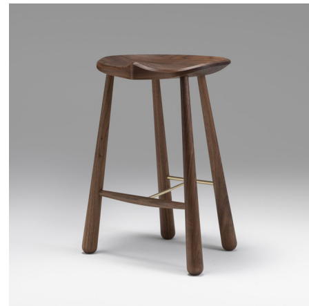
Shown in black walnut

The Taper Stool offers a refined, modern interpretation of a simple, utilitarian milking stool. The formed seat is supported by a trio of distinct, teardrop-shaped legs that heighten the functional design with an artistic touch.