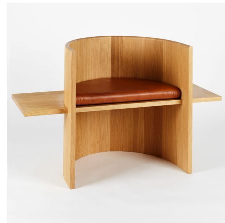
Shown in white oak / caramel leather

The Sit Set Chair possesses a modern, geometric silhouette constructed from solid wood using traditional joinery techniques without screws or other mechanical fasteners. The chair's back and legs are formed by a coopered half-cylinder, which is intersected by a rectangular plane to form the seat and side shelving. A leather-upholstered cushion provides a comfortable seat and complements the natural look of the wood grain.