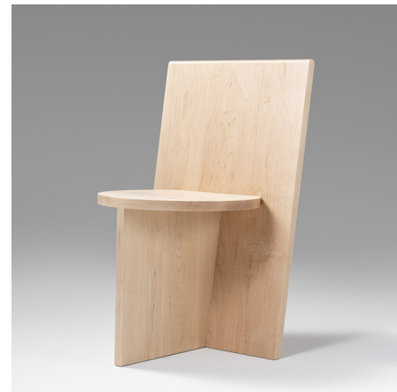
Shown in hard maple

The Three Plane Chair features three simple geometric forms which have been thoughtfully arranged to support a seated person. The chair's rigid geometry and minimalist silhouette are contrasted by the natural texture of its wooden construction to create a warm, welcoming expression.