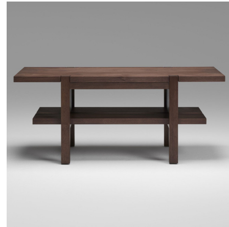
Shown in black walnut

The Chamber Side Table was originally designed for Inness, a Hudson Valley hotel and resort that takes its design cues from the surrounding environment. Chamber's simple rectangular form is rooted in the concepts of utility and clarity of construction, while its solid wood construction introduces the warm, natural texture of wood grain to contrast the table's rigid right angles.