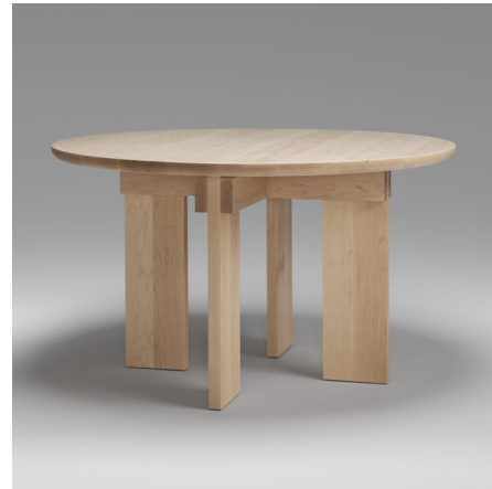
Shown in hard maple

The Chapter Dining Table was originally designed for Inness, a Hudson Valley hotel and resort that takes its design cues from the surrounding environment. Chapter's round tabletop is set atop flat, rectangular legs with exposed joinery lending an understated, utilitarian accent. Chapter is heavy both visually and materially, making it a perfect anchor for any room used for dining and conversation.