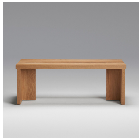
Shown in white oak

The Grange Bench was originally designed for Inness, a Hudson Valley hotel and resort that takes its design cues from the surrounding environment. The bench is constructed of wooden planks positioned orthogonally for a simple expression inspired by Inness' rural setting. Note: Ebbonized Oak finish is only available in 60 inch size.