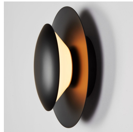
Shown in blackened brass / opal

The Bell Wall Sconce was originally designed for Inness, a Hudson Valley hotel and resort that takes its design cues from the surrounding environment. Bell's purely geometric form is understated but elegant, a perfection addition to any space in need of soft, intimate lighting. The shade houses an integrated LED light source and is available in all opal glass or opal glass with a metal cap. Unlacquered Brass is a living finish, meaning it will darken and patina over time. Polishing will restore the sheen if desired.