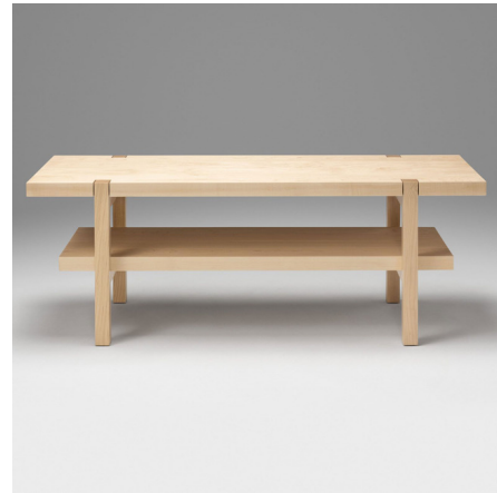
Shown in hard maple

The Chamber Bench was originally designed for Inness, a Hudson Valley hotel and resort that takes its design cues from the surrounding environment. Chamber's simple rectangular form is rooted in the concepts of utility and clarity of construction, while its solid wood construction introduces the warm, natural texture of wood grain to contrast the bench's rigid right angles.