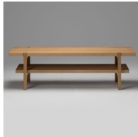
Shown in white oak

The Chamber Bench was originally designed for Inness, a Hudson Valley hotel and resort that takes its design cues from the surrounding environment. Chamber's simple rectangular form is rooted in the concepts of utility and clarity of construction, while its solid wood construction introduces the warm, natural texture of wood grain to contrast the bench's rigid right angles.