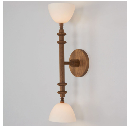
Shown in white oak / bone china

PRODUCT DIMENSIONS . . . . . Backplate: 5.75" diameter LAMP LIFE . . . . . 50000 hours COLOR RENDERING . . . . . 90 CRI LAMP COLOR . . . . . 2700K LUMENS/WATT . . . . . 125.00 LUMINOUS FLUX . . . . . 1000 lumens