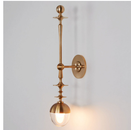
Shown in unlacquered brass / clear

PRODUCT DIMENSIONS . . . . . Backplate: 5" diameter LAMP LIFE . . . . . 50000 hours COLOR RENDERING . . . . . 90 CRI LAMP COLOR . . . . . 2700K LUMENS/WATT . . . . . 62.50 LUMINOUS FLUX . . . . . 500 lumens