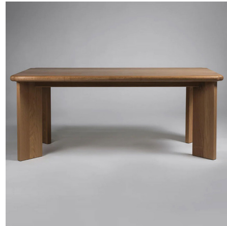
Shown in white oak

The Monroe Rectangular Dining Table is based on the classic gothic architecture motif of the quatrefoil to create a four-sided table with no corners. The tabletop is set atop angled rectangular legs for a crisp, geometric form that showcases the table's solid hardwood construction.