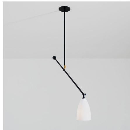
Shown in matte black / opal

The Slope Pendant is an exercise in fluidity and structure that has been refined into its most essential, functional forms. The slender stem hangs at an angle to support a tapered opal glass shade. The pendant can be rotated 320 degrees to direct its light where it is needed. Included 35 inch stem can be adjusted on site.